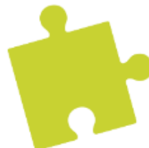
6. Being the Best Friends We Can Be

I can use Calm Me time to manage my feelings