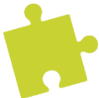
1. My Family and Me

I can identify some of the jobs I do in my family and how I feel like I belong