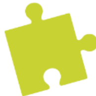
2. Make Friends Make Friends Never Ever Break Friends Part 1

I can identify some of the jobs I do in my family and how I feel like I belong