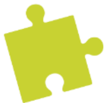
3. Make Friends Make Friends Never Ever Break Friends Part 2

I know how to make friends to stop myself from feeling lonely