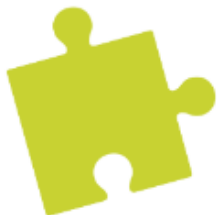
5. Falling Out and Bullying Part 2

I am starting to understand the impact of unkind words