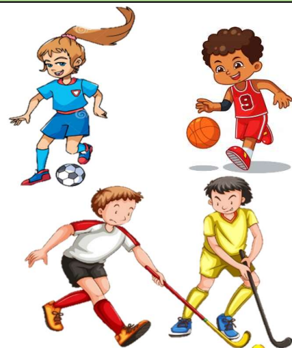
-Invasion games include football , hockey and basketball .